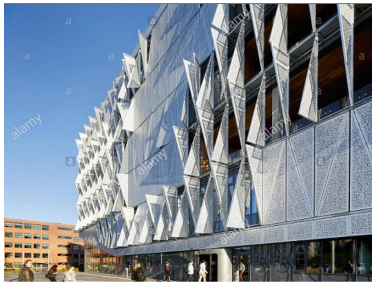
Figure (7): kolding campus, university of southern denmark