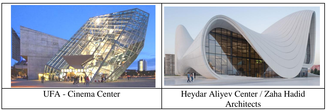
Figure (6): Deconstruction forms "Source" (Photograph of UFA Cinema Centre, 2021)

climatic state to add value to their thoughts. Figure(6) (Chesbrough & Prencipe, 2008).