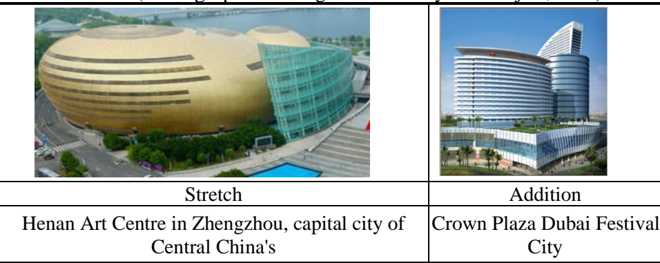
Figure (5 B): Editing and adapting the regular mass of building "source" (Photograph of Henan Art centre, Zhengzhou, 2021)